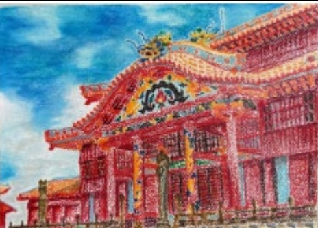
Hakusan Cheers Club member (Grade 3, Elementary), Ishikawa Prefecture