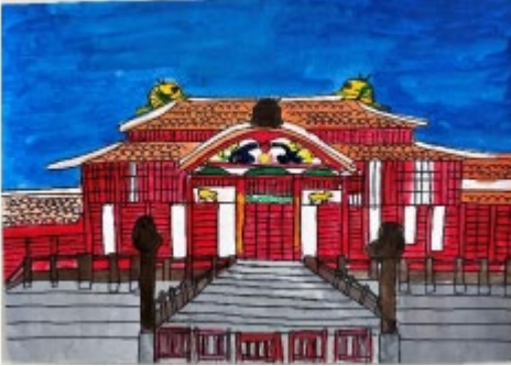
Tsuchiura Cheers Club member (Grade 4, Elementary), Ibaraki Prefecture