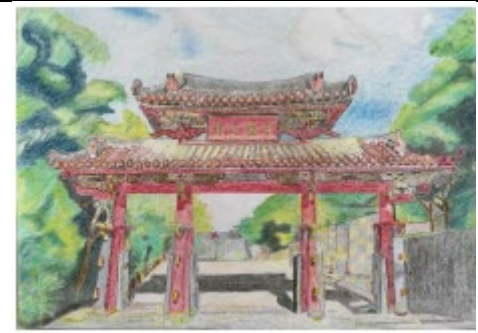
Hineno Cheers Club member (Grade 2, Junior High), Osaka Prefecture