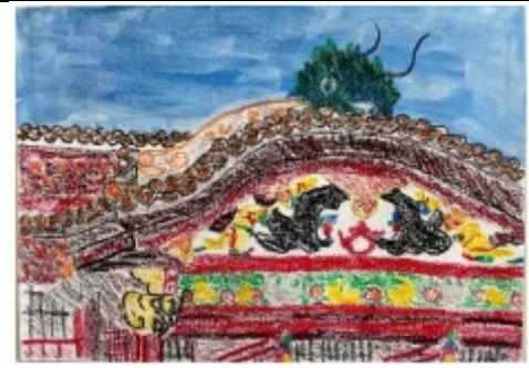
Susono Cheers Club member (Grade 6, Elementary), Shizuoka Prefecture