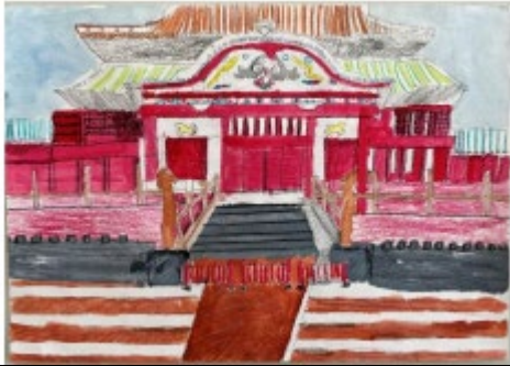
Asahikawa Ekimae Cheers Club member (Grade 5, Elementary), Hokkaido