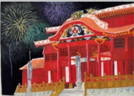
Kuwana Cheers Club member (Grade 1, Junior High), Mie Prefecture