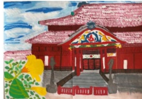
Ontakesan Ekimae Cheers Club member (Grade 5, Elementary), Tokyo