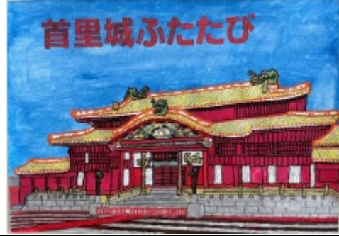
Sendai Cheers Club member (Grade 4, Elementary), Miyagi Prefecture