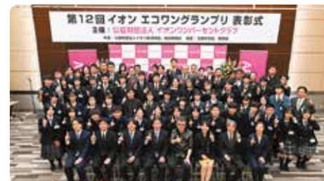
Commemorative photo with the judges at the award ceremony