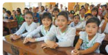
Children studying in their new school building

Number of children enabled to attend school 370,000 children Total number of newly-built schools supported 426 schools