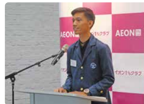
Student giving a speech at the Scholarship Granting Ceremony in Indonesia

*Number of granted scholarships are listed by country where universities are located; in the case of Japan, number refers to international students.