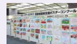
Display of 49 posters, including prize-winning entries

We host this competition so that children can express support for the restoration by drawing Shuri Castle as well as learning about this historical and cultural heritage, and held the award ceremony at the same time as the donation presentation ceremony. At the award ceremony venue, 49 posters including prize-winning entries were displayed, from among the 465 richly imaginative and colorful artworks received from across Japan.