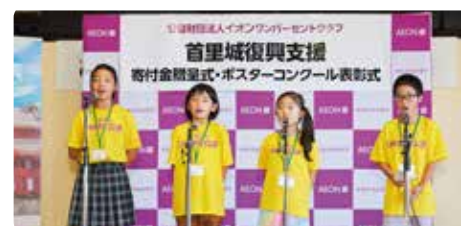
Chanting a message of support to Okinawa Prefecture at the Award Ceremony