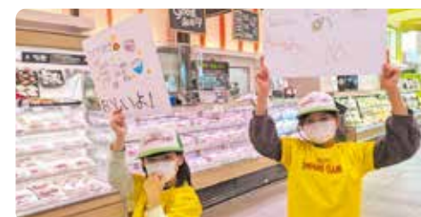
Selling rice grown by the club from seedlings (Cheers Club Kasumi Tsukuba)