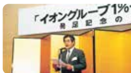
Founding of AEON 1% Club in 1990

Since our founding in 1990, we have continued to carry out our activities for more than 30 years, with the cooperation of many people. We will continue to move forwards, aiming toward a joyful future.