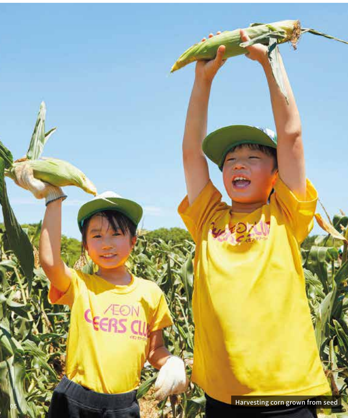
Harvesting corn grown from seed

Elementary & Junior High School Students