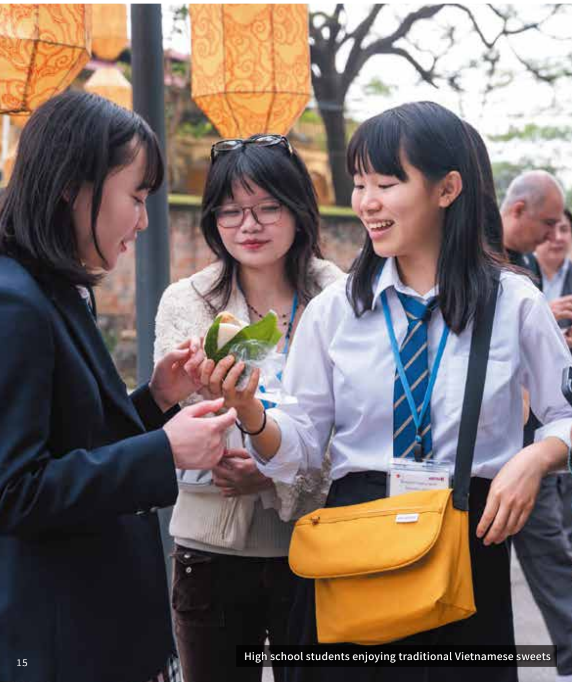
High school students enjoying traditional Vietnamese sweets