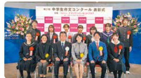
Commemorative photo of judges and award winners at the award ceremony