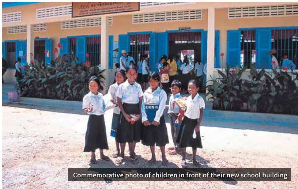
Commemorative photo of children in front of their new school building