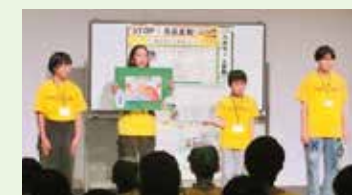
Presentation by Hokkaido Area 1st-place club members

We host the “Wall Newspaper Competition”, where club members summarize and present the contents of their year’s activities on poster-size paper at the end of the fiscal year, with the objective of developing their ability to organize and convey information. Members demonstrate the results of their everyday initiatives via presentations that incorporate a range of creative methods. In fiscal year 2023, we invited an external panel of judges, and held final evaluations in 12 areas nationwide.