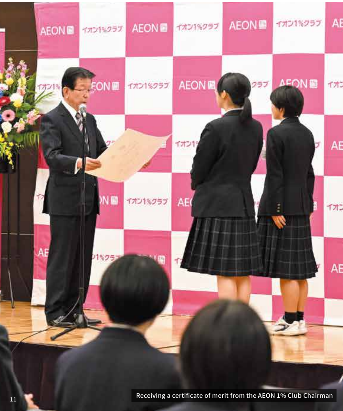
Receiving a certificate of merit from the AEON 1% Club Chairman