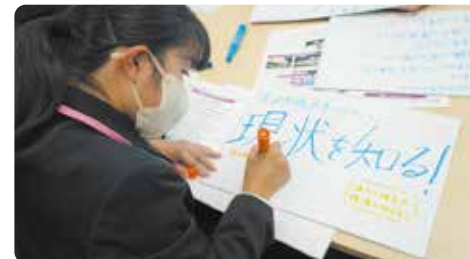
Discussion about actions to protect the environment during the environmental eco-tour