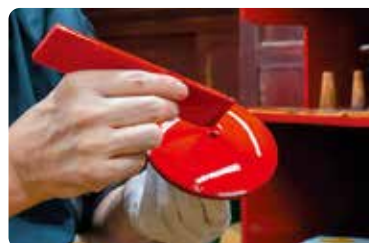
Traditional craft Wajima-nuri lacquerware