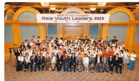
Commemorative photo together with the judges