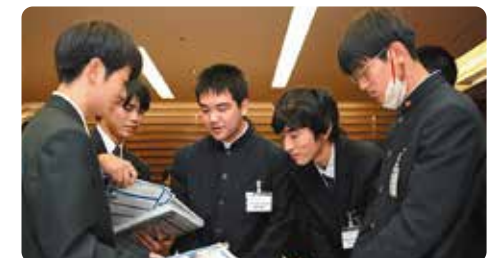
Exchanging opinions at the after-party