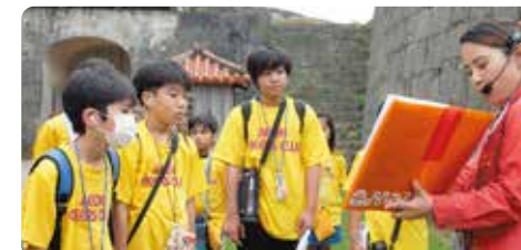
Learning about history during a Special Study Tour of Shuri Castle Park