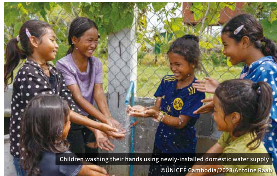
Children washing their hands using newly-installed domestic water supply