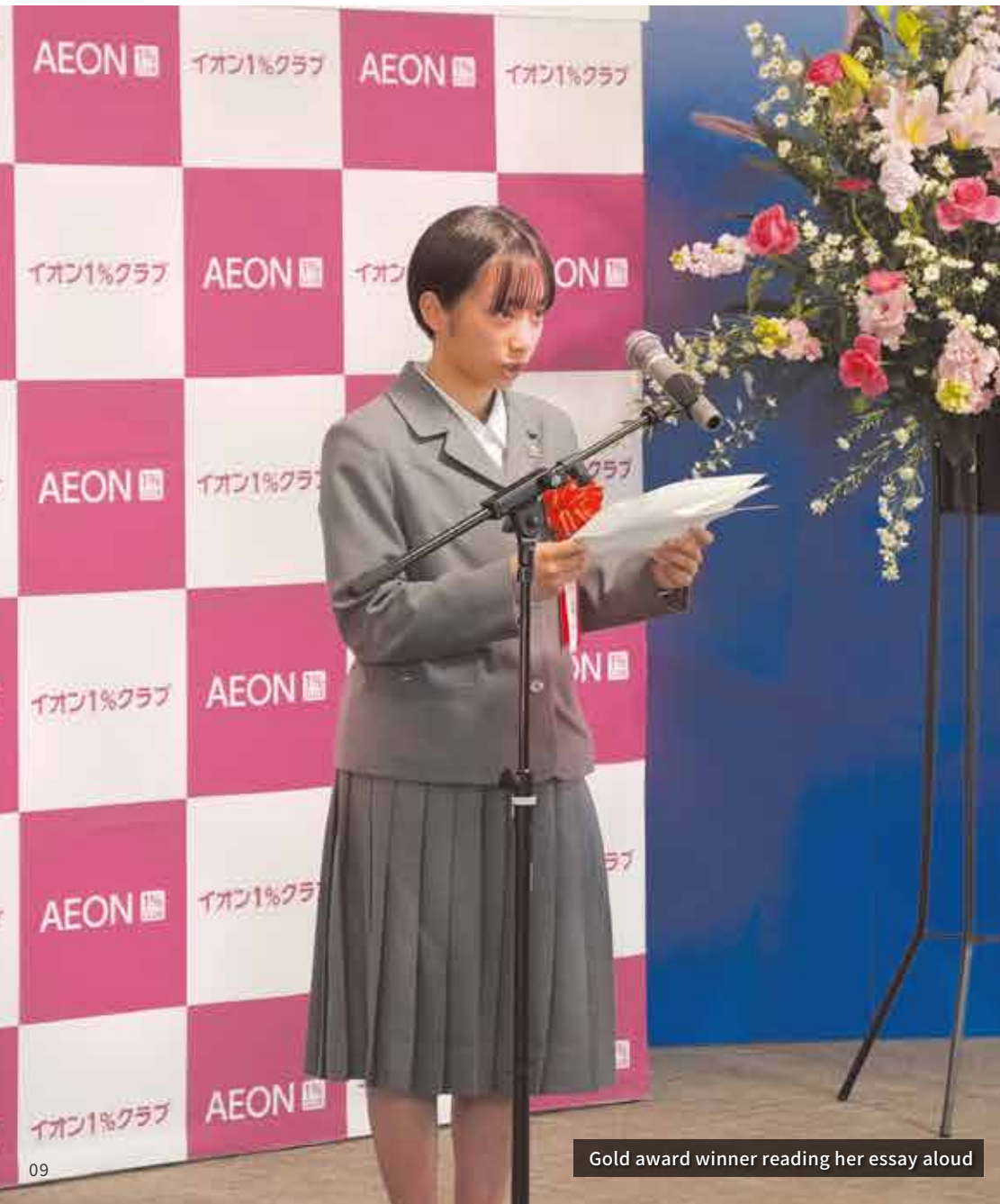
Gold award winner reading her essay aloud