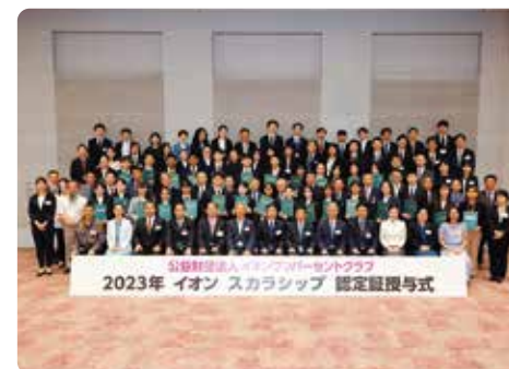
Commemorative photo of scholarship students studying abroad at Japanese universities, together with guests