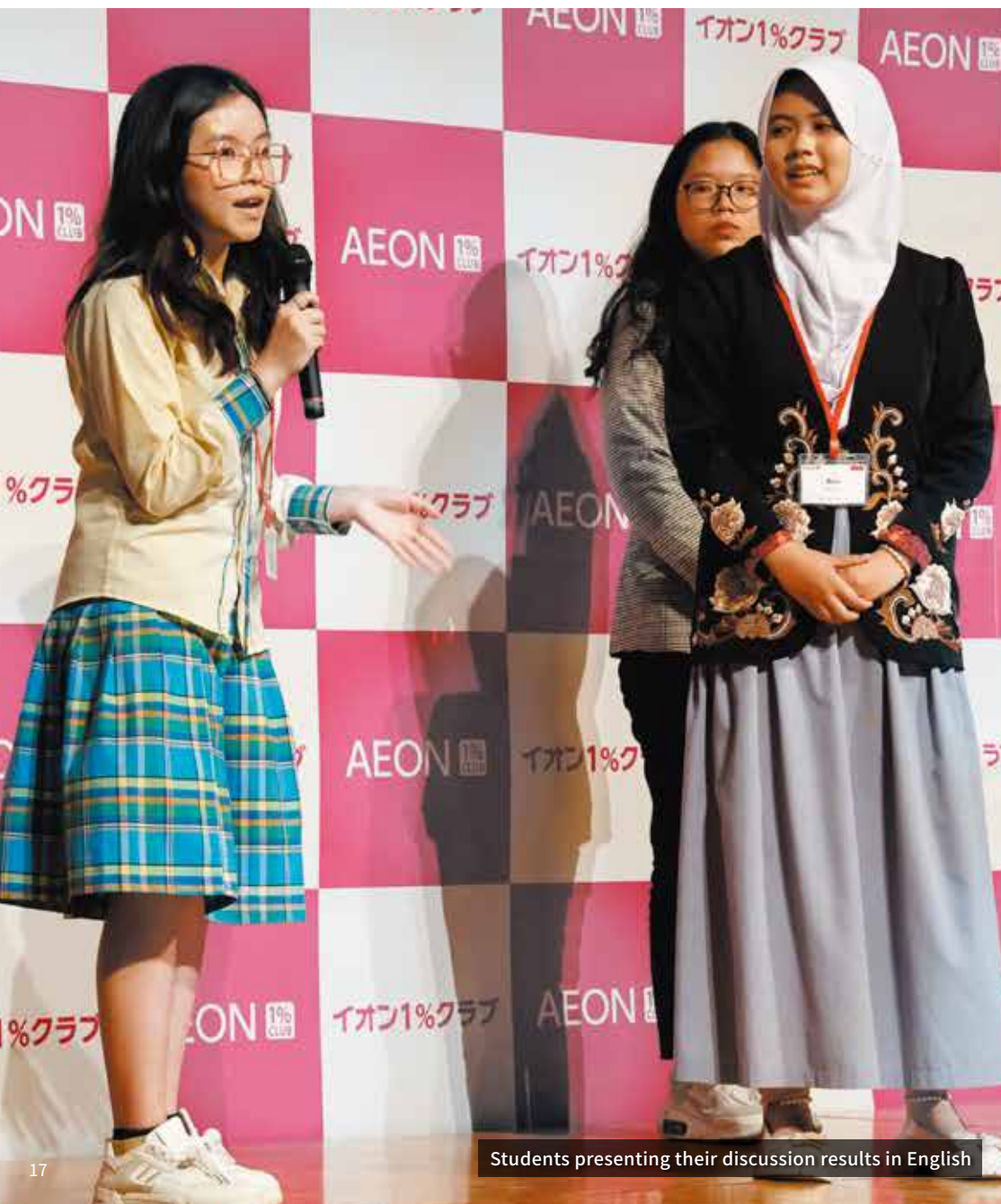
Students presenting their discussion results in English