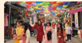
Taking a walk with traditional dress and experiencing local culture

Students experience each country's traditions and culture. Also learn about their history and culture through visiting historic sites and facilities that are unique to that country.