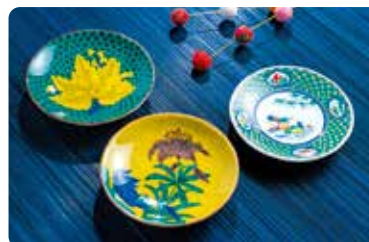
Traditional craft Kutani-yaki pottery

Number of projects supported in FY2023 72 projects Cumulative total number of supported projects 848 projects