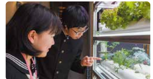
Observing vegetables grown by 100% artificial light cultivation during the environmental eco-tour