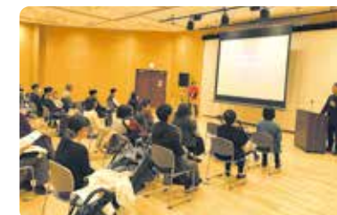
Lecturer giving a childcare seminar