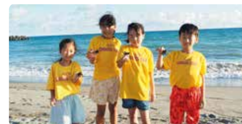
Sea Turtle Observation (Cheers Club Hamamatsu Nishi)