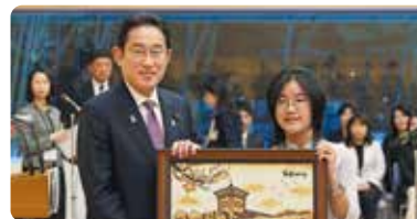
Courtesy visit to Prime Minister Kishida in the FY2023 Japan program

Cumulative total number of participants 2,521 students