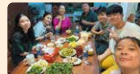
Gathering around the dinner table at a homestay in Vietnam

Friendships are formed between student pairs by experiencing each other's lives in classroom experiences at school, homestays, and the like.