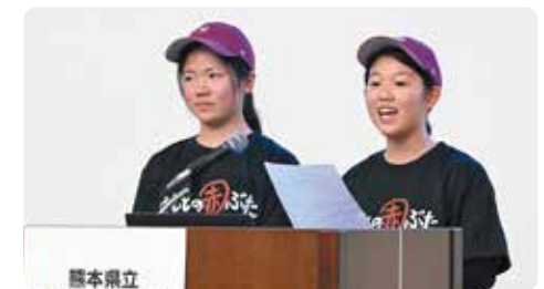
Answering questions from the judges