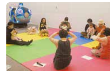
Enjoying a parent-and-child gesture game