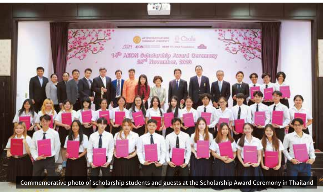
Commemorative photo of scholarship students and guests at the Scholarship Award Ceremony in Thailand