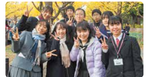
Taking part in the 2-day environmental eco-tour after the award ceremony