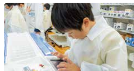
Children's Pharmacist Experience (Cheers Club Welcia Shizuoka)