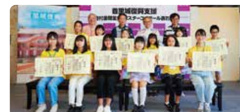
"Shuri Castle Reconstruction Support Poster Competition 2023" Award Ceremony