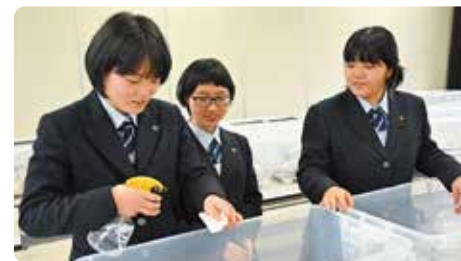
Activity by Prime Minister's Award-winning school