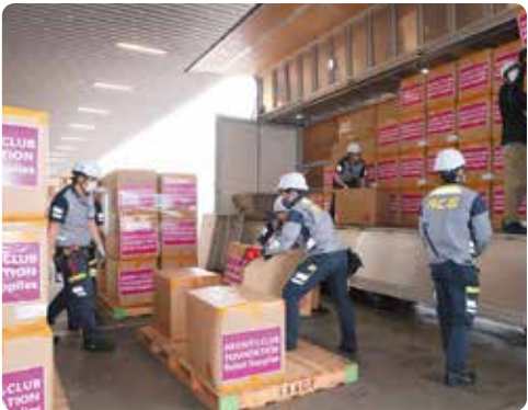
Loading relief supplies onto a truck to be transported