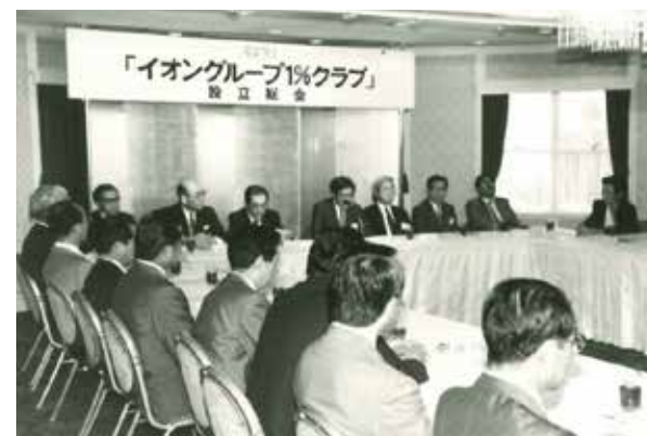
Inaugural General Meeting (August 1, 1990)

In order to consistently carry out such activities regardless of corporate performance, each of the major AEON Group companies donates 1% of their pre-tax profits to the AEON 1% Club, and on this basis, the AEON Group devotes our efforts to tackling environmental and social contribution activities.