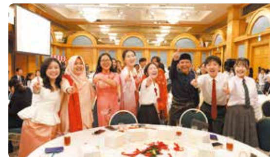
Team who achieved 1st place at the presentation session