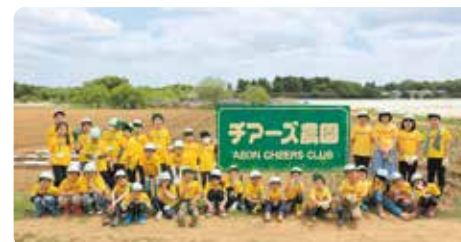
Cheers Farm Opening Ceremony (Ushiku City, Ibaraki Prefecture)