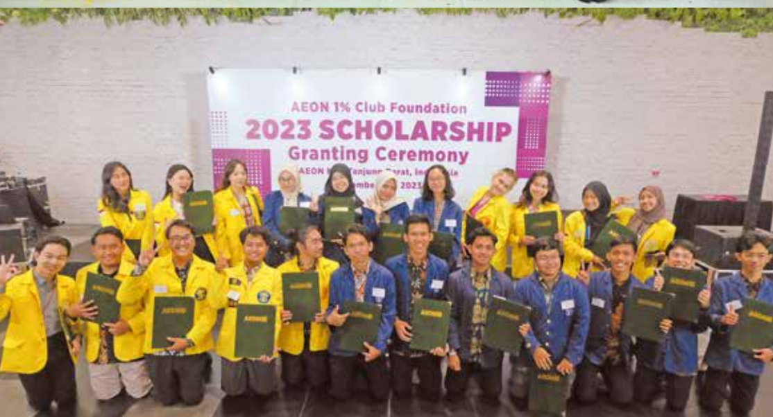
Commemorative photo of scholarship students at the Scholarship Granting Ceremony in Indonesia