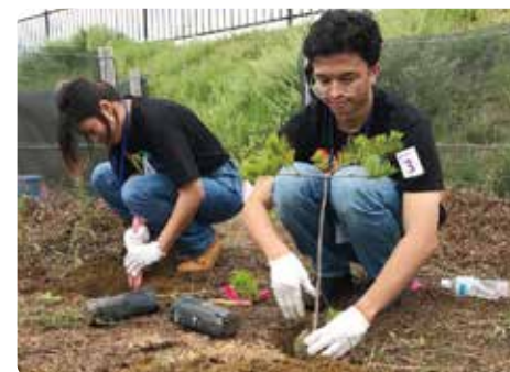
Tree-planting volunteer activity by scholarship students (Ishinomaki City, Miyagi Prefecture)