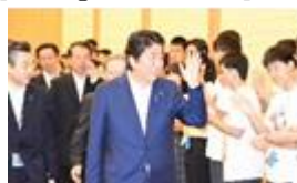
Visit to the Office of Prime Minister