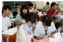
Classroom in China