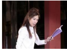
Aeon Hometown discovery