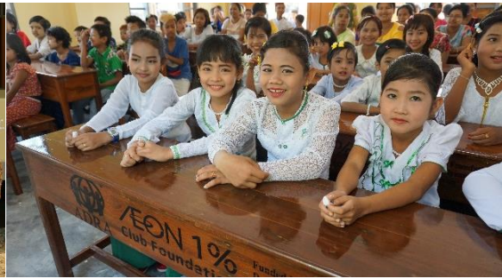
Children delighted with their new school