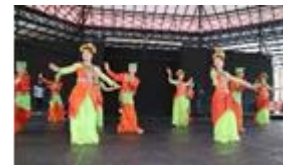
Traditional dance in Indonesia