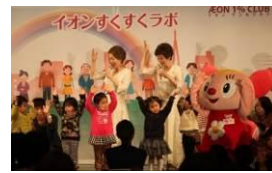
AEON Sukusuku Labo

*See details ( https://www.aeon.info/1p/en )